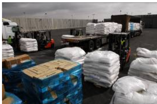
Trucks with humanitarian assistance cross into the Gaza Strip