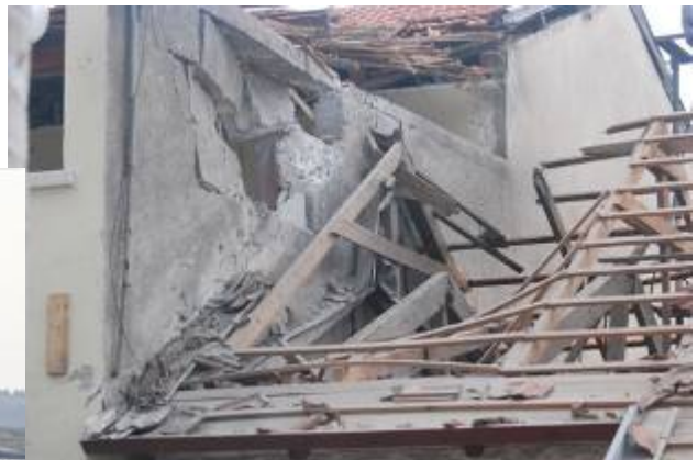
Direct hit at a house in Sderot