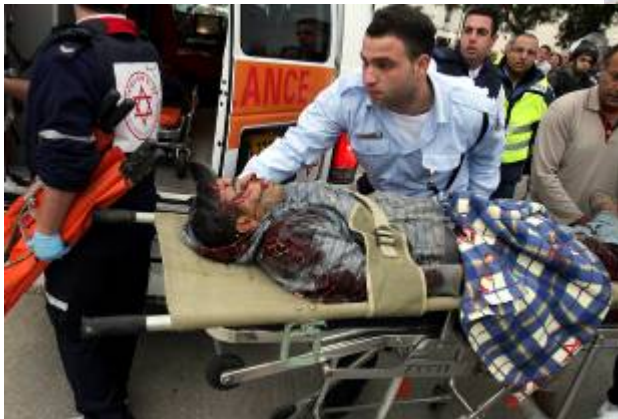
Injured man being evacuated from a construction site in Ashkelon that suffered a direct rocket hit. One person was killed and several others were severely and moderately injured (Foreign Ministry, December 29, photo by Edi Israel)