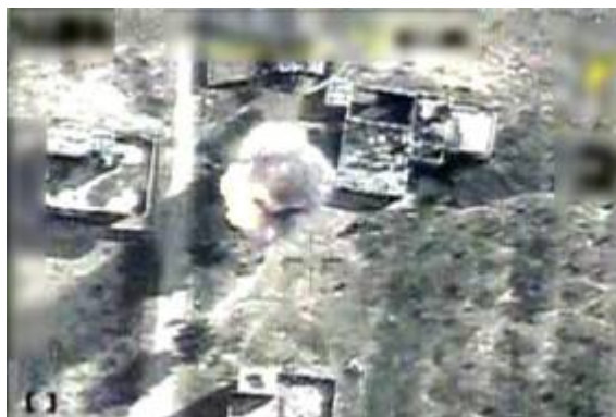
Attack on a truck loaded with Grad rockets (IDF Spokesman, December 29). To view a video of the attack, click here .

7. The Air Force attacked a Hamas truck loaded with dozens of Grad rockets in the Jabalia region (northern Gaza Strip). The truck was hit and the rockets exploded. It appears that Hamas wanted to transport the rockets from a building in which they were stored to a safe location, fearing that their present location would come under attack by the IDF, or in order to bring them closer to launch sites where they could be fired on Israeli population centers (IDF Spokesman website, December 29).