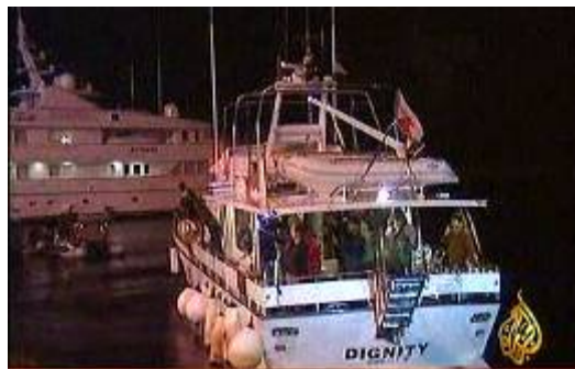
The ship Dignity before leaving Cyprus on December 29