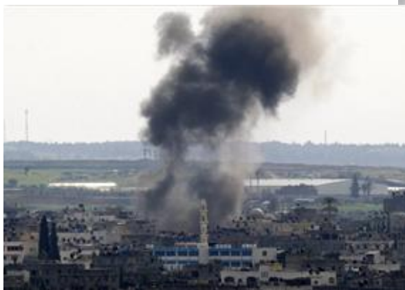
Israeli Air Force raid in Gaza City (Palestine-info, December 29)