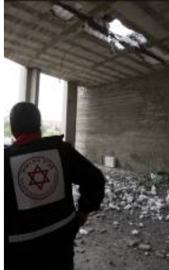
The construction site in Ashkelon in which Hani al-Mahdi was killed (Foreign Ministry, December 29, photo by Edi Israel)

b. Around 21:00, a long-range rocket landed (for the first time) in downtown Ashdod , killing Irit Shitrit , who sought shelter at a bus station which was then hit by the rocket. Eight other civilians were injured, one of them severely (Irit Shitrit's sister), two lightly, and the rest suffered stress-related injuries.