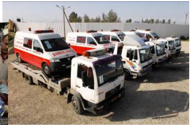
On December 29, Israel allowed the crossing of more than 60 trucks and 10 ambulances to the Gaza Strip through the Kerem Shalom Crossing (IDF Spokesman, December 29)