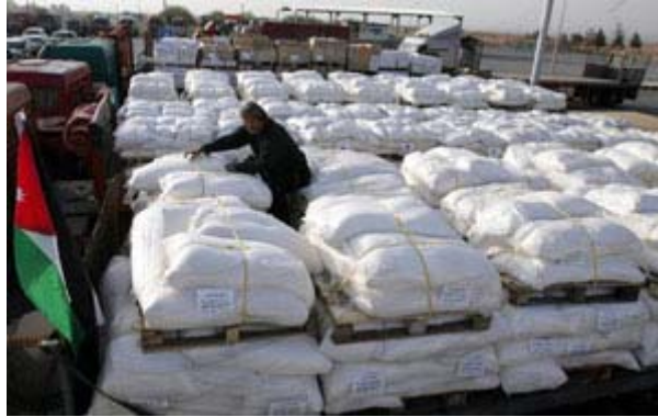
Food shipment at the Rafah Crossing on December 29 (Al-Hayat al-Jadida, December 30)

16. On December 29, an aid plane of the Iranian Red Crescent landed in Egypt. It was reported that another plane was on its way (ISNA, December 29). The Iranian aid ship Iran-Shahed left the Bandar Abbas port on December 29 en route to Jordan's port of Aqaba (Mehr News Agency, December 29). Iran announced that two more ships would embark soon (ISNA, December 29).